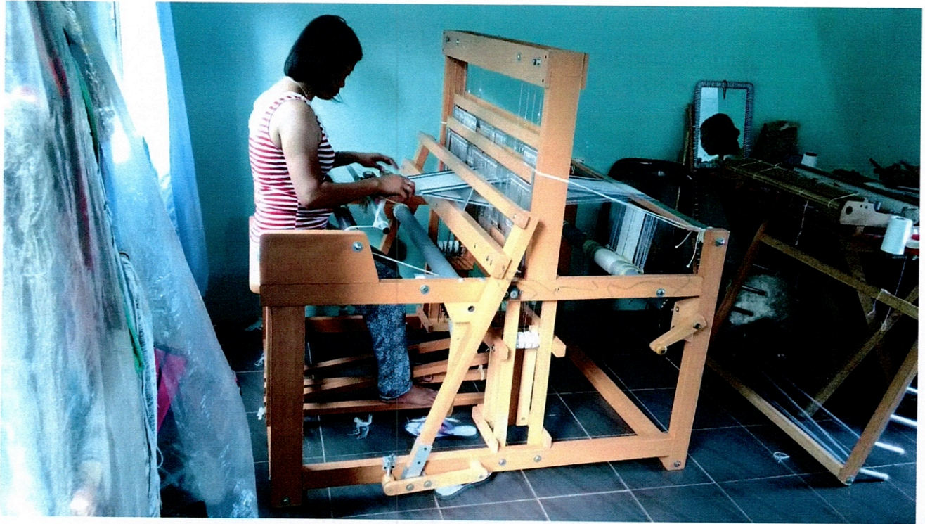
C. 40" Modified Handloom Weaving Machine Form harness equipped with ordinary metal reed