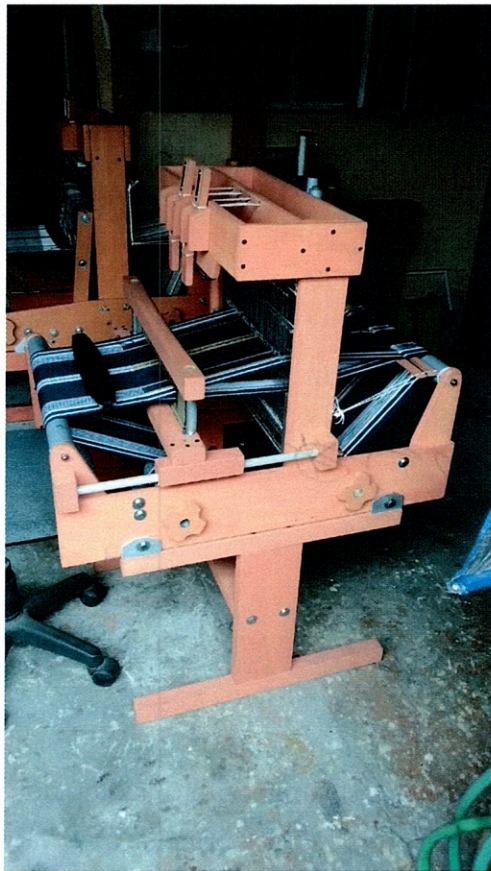
B. 18" Thera Loom Four harness with sliding beater equipped with reed w/o pedal