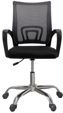
b. Item No. 4. Office Chair